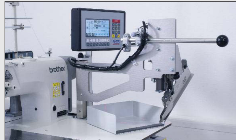
The swivel-out folding station enables easy access for set-up and service work