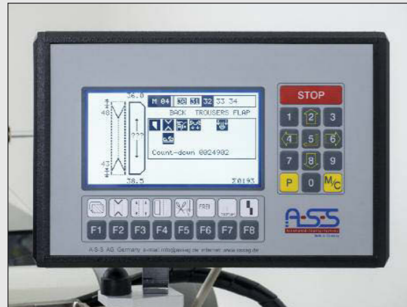
Easy administration and retrieval of the pre-programmed seams for diverse applications