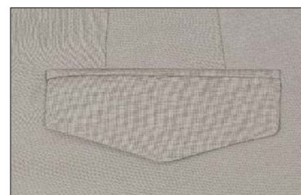
2 Double welt pocket with flap