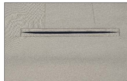
1 Double welt pocket

All straight double or single welt pockets, with or without flaps can be processed.