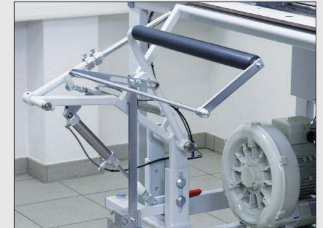
The ready-made parts are stacked automatically