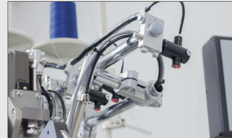
Laser markings for accurate and clear positioning