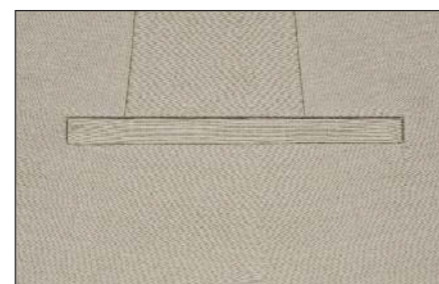
3 Single welt pocket